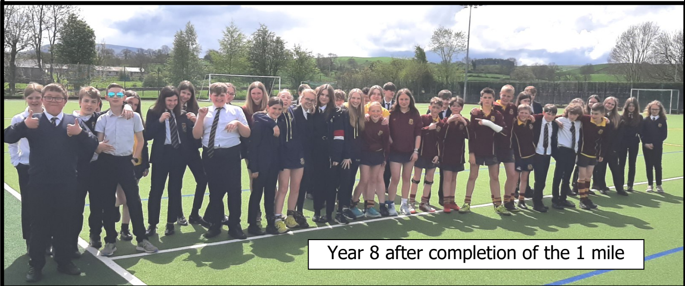
Year 8 after completion of the 1 mile