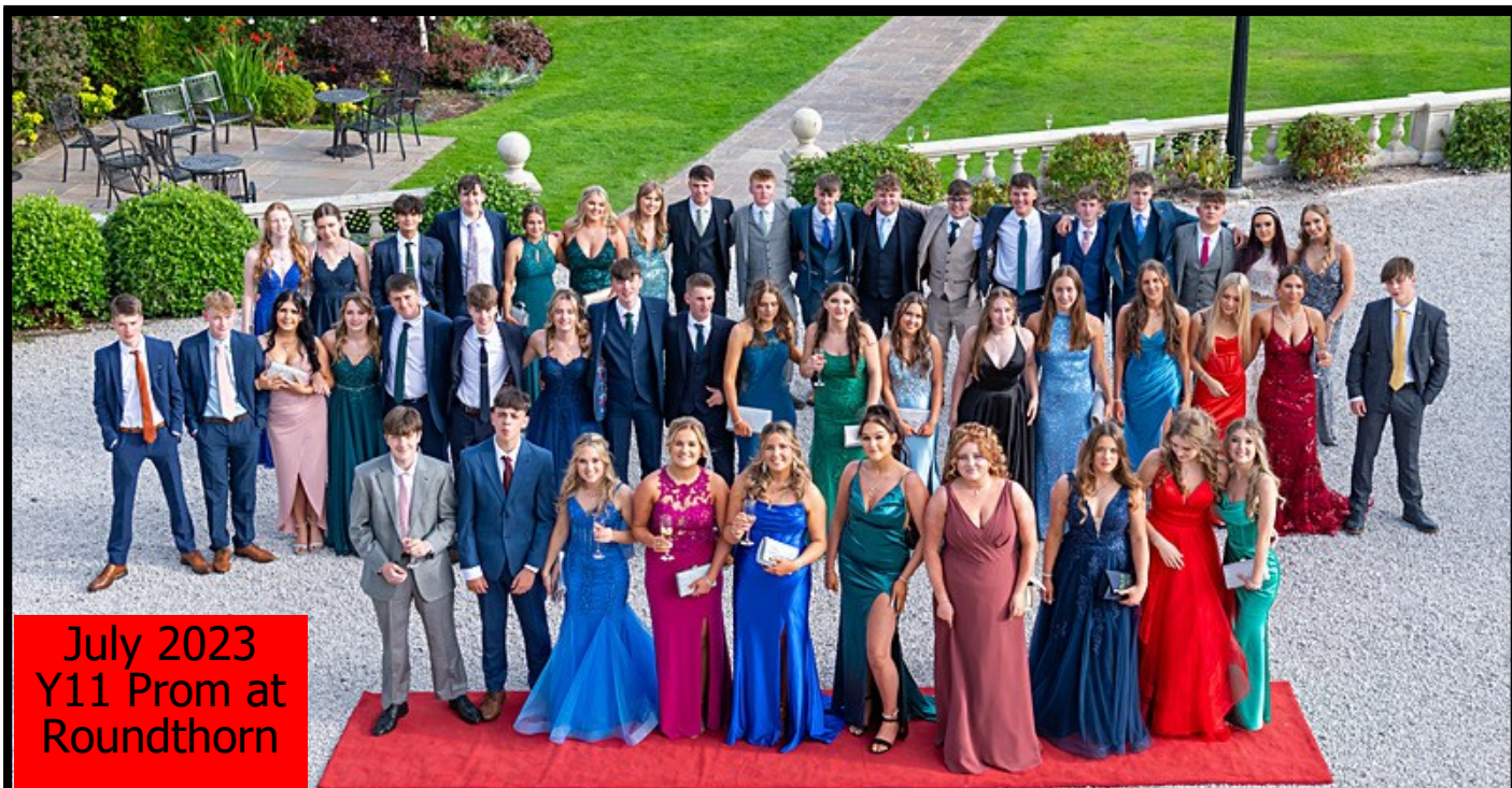
July 2023 Y11 Prom at Roundthorn